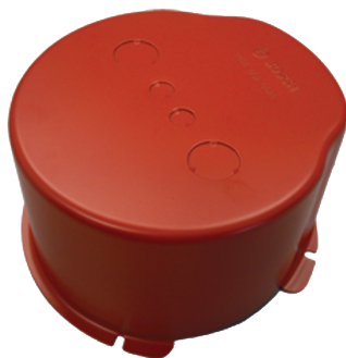
LBC 3080/01 Fire Dome (optional)